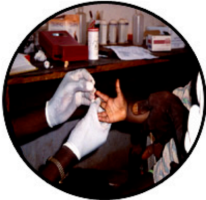
Sampling blood by fingerstick to determine hemoglobin level. Study of Anemia in children in refugee camps. Western Tanzania, 1998.

From the International Emergency Refugee Health Branch of the CDC.