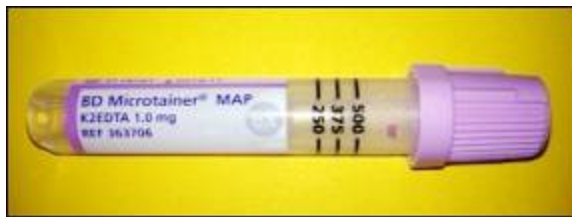
Becton Dickinson (BD) Microtainer® MAP 250µL - 500µL Tube (Catalog #363706)

The DSHS Laboratory will accept this tube for THSteps fingerstick blood collection specimens.